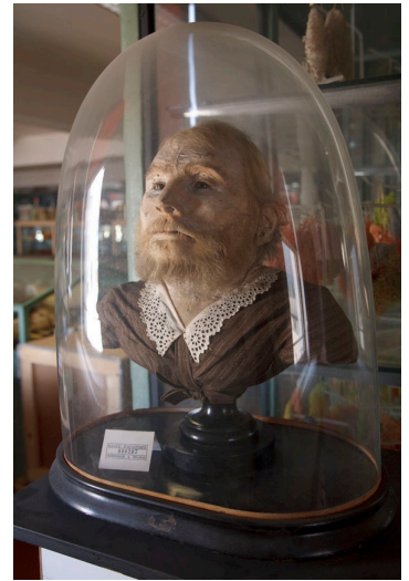
“Femme à Barbe, Musée Orfila. Giclée Print.

Photographer and blogger Joanna Ebenstein has traveled the world seeking and documenting untouched, hidden, and curious collections, from museum store-rooms to private collections, cabinets of curiosity to dusty natural history museums, obscure medical museums to hidden archives. The exhibition “The Secret Museum” will showcase a collection of photographs from Ebenstein’s explorations—including sites in The Netherlands, Italy, France, Austria, England and the United States—which document these spaces while at the same time investigating the psychology of collecting, the visual language of taxonomies, notions of “The Specimen” and the ordered archive, and the secret life of objects and collections, with an eye towards capturing the poetry, mystery and wonder of these liminal spaces. In tandem with this exhibition, Ebenstein has organized a two week “Collectors Cabinet” at the The Coney Island Museum, which will showcase astounding objects held in private collections, including artifacts featured in her Private Cabinet photo series of 2009.